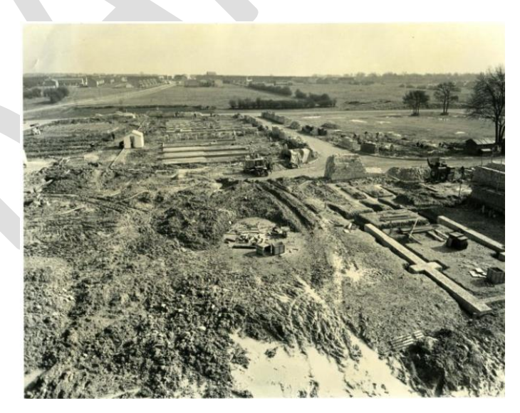
Stevenage Town Centre (1957)

and in 2015, through collaboration with partners, invested £1 billion in a regeneration programme to reinvigorate the town centre and surrounding areas. This 20-year project to deliver multiple residential, commercial and retail schemes and improve our leisure and cultural offer is progressing at pace, and we want our residents to benefit from this, not only in terms of access to improved amenities and green spaces, but access to jobs in response to the industrial and economic growth this investment will deliver.